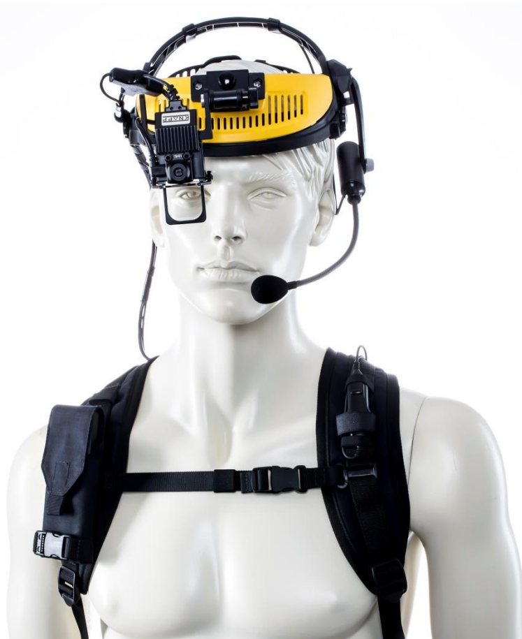
KiSoft WebEye: headset with mini camera, see-through-display, headphones, microphone and vest.

KiSoft WebEye consists of a headset complete with mini camera, a see-through display, headphones and a microphone, as well as a vest with a portable PC, battery and a wireless mini keyboard. If a KNAPP customer experiences a breakdown or requires maintenance work to be carried out, a customer service technician will get to the customer site as quickly as possible, get "hooked up" to the system and then connect to the service center at the click of a button. Thanks to the camera in the headset, the experts can then see "live" everything that the on-site technician is seeing, and can communicate with him via the microphone/headphones.