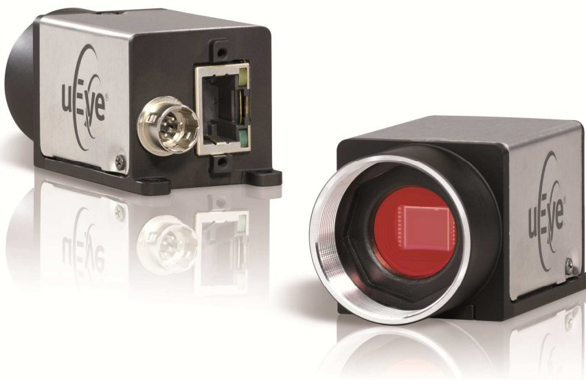
GigE uEye CP camera

IDS camera integration in Genika Trigger has been a breeze thanks to the uEye SDK. “The IDS SDK is exhaustive and the different camera models are supported seamlessly, which is far from being common along camera suppliers. In addition the documentation is complete for both C++ and .Net environment”, outlines Frédéric Jabet from Airylab. “In fact we even plan to port IDS camera to the astronomical application Genika Astro that requires high sensitivity hardware. The E2V sensor may be a real asset for those low light applications.”